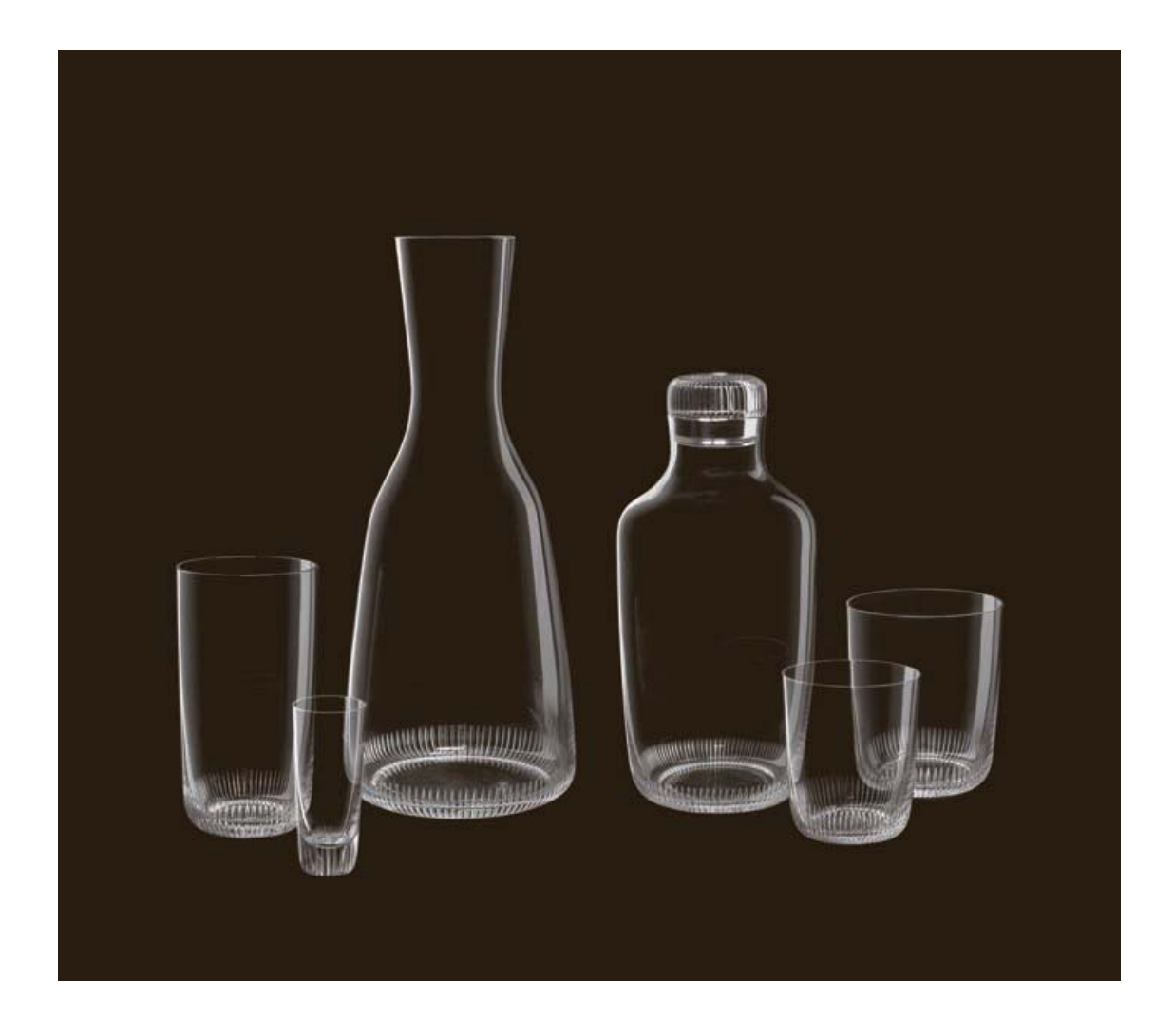
Drinking set no.281 - "grip"